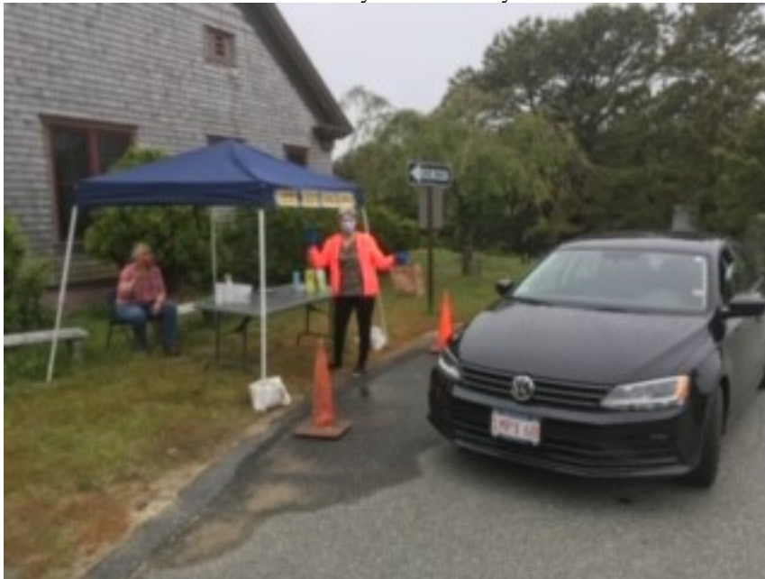
Curbside Delivery-Truro Library