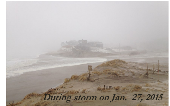
During storm on Jan. 27, 2015