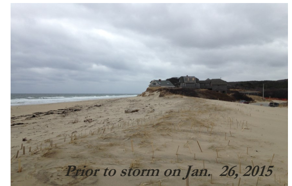
Prior to storm on Jan. 26, 2015